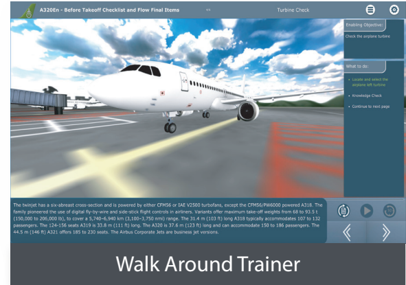
Walk Around Trainer

When paired with Invent , CPaT's content creation and editing software, airlines can develop unlimited lessons tailored to their specific needs and make real-time modifications on-demand.